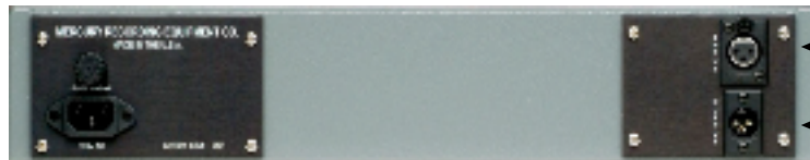
Back view of Mercury AM16, Single Channel

Input XLR, Pin 2 Hot Transformer Balanced Input and Output Output XLR, Pin 2 Hot